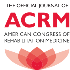
Table of Contents: Volume 98 / Number 11 / November 2017